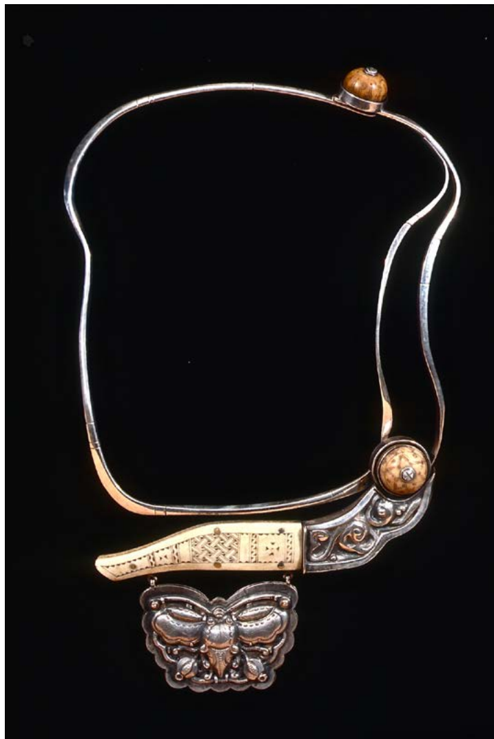
Ron Ho, Lepidoptera .

Copper to create pendants and beads Plastic display boxes to display repousee pieces in necklace compositions Assorted colored and size beads Liver of Sulfur for oxidation Copper Wire to make catches Copper tubing Steel Wool Drawing paper, pans and pencils Drills Sawblades Masking tape Crimps, rivets, jump rings