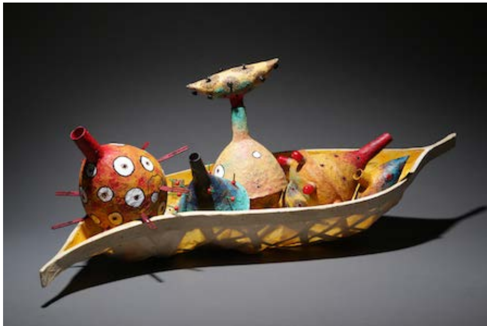
Alien Fruit Basket