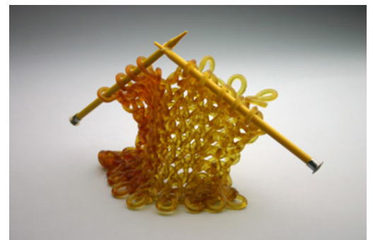
Carol Milne's "Bent", 6x10x 4.5" kiln cast lead crystal and knitting needles, 2014