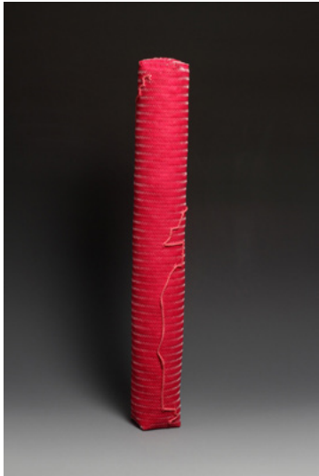
Dorothy McGuinness, "810 Commute" Watercolor paper, acrylic paint, ribbon, 26 x 4 x 4"