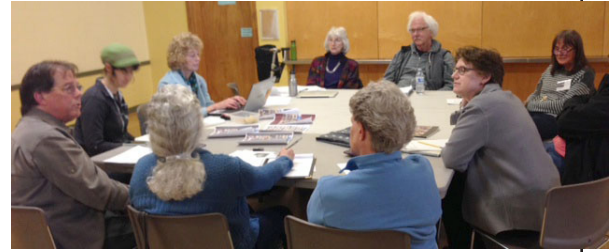
Board meeting at the Phinney Monthly Meeting

We, on the board, are beginning to think about replacing ourselves. Ironically, it is one of the most important tasks we have. It's what ensures the survival of the organization. We're thinking about it now in the spring because, in a perfect world, the new volunteers would emerge over the summer, be able to attend some meetings next fall and be ready to take over in January. And it is a massive turn-over in January -- President, Vice-president, Treasurer, Secretary, Exhibitors, Newsletter, and Publicity are completing their commitments. It's a situation that deserves serious attention from NWDC members.