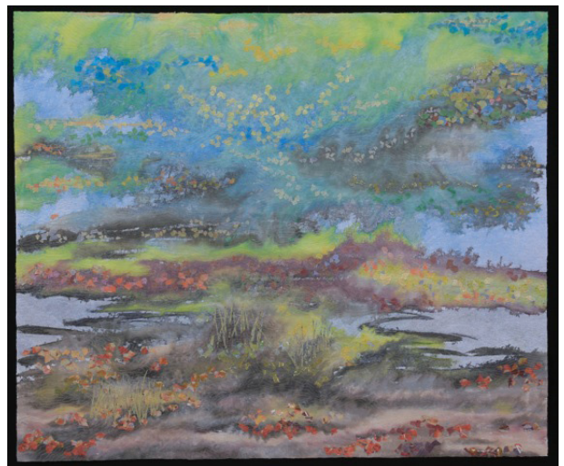
Marshland Reflections, 42 x 50"

This journey of discovery has been intersected with fascinating detours into writing, teaching and assembling exhibitions. I will talk about a recent exhibition, Traces , that I selected for the Gregg Museum in Raleigh, NC, show the work of these artists and briefly discuss the process of putting this large exhibit together".