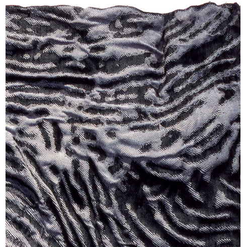
A white thread that shrinks when heated was used to weave “Passport,” (right) a collage of thumbprints. The shrinkage resulted in a topographical landscape seen in this detail.

Evert Sodergren was featured in the April issue of “Art and Antiques,” “One Piece at a Time: The craftsmen of the studio furniture movement”. Page 58 -64