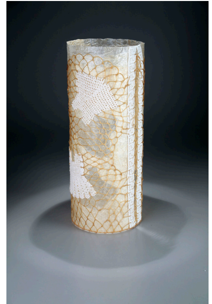
Jill Nordfors Clark's "SIBLINGS" Stitched and layered hog casings, vintage crocheted lace, 20.25" H X 8" diameter