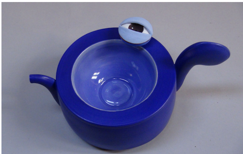
Blue Irish Lois Harbaugh