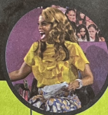
Great Performances: Merry Wives