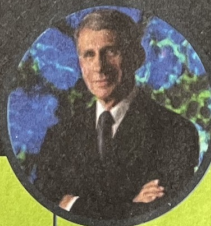
Crosscut Festival Main Stage