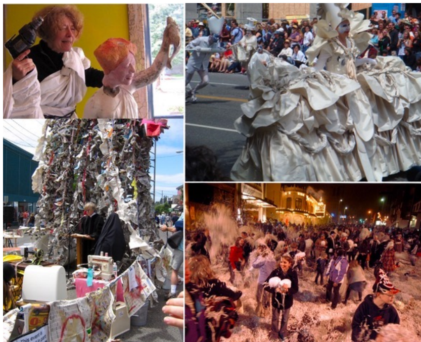
Clockwise from upper left in the collage:

Find your local number: https://us02web.zoom.us/u/kzNB2abT6