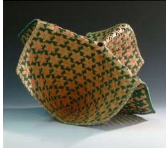
Dorothy McGuinness Shooting Stars