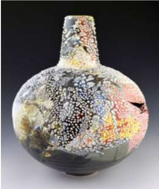
Ken Turner Trauma