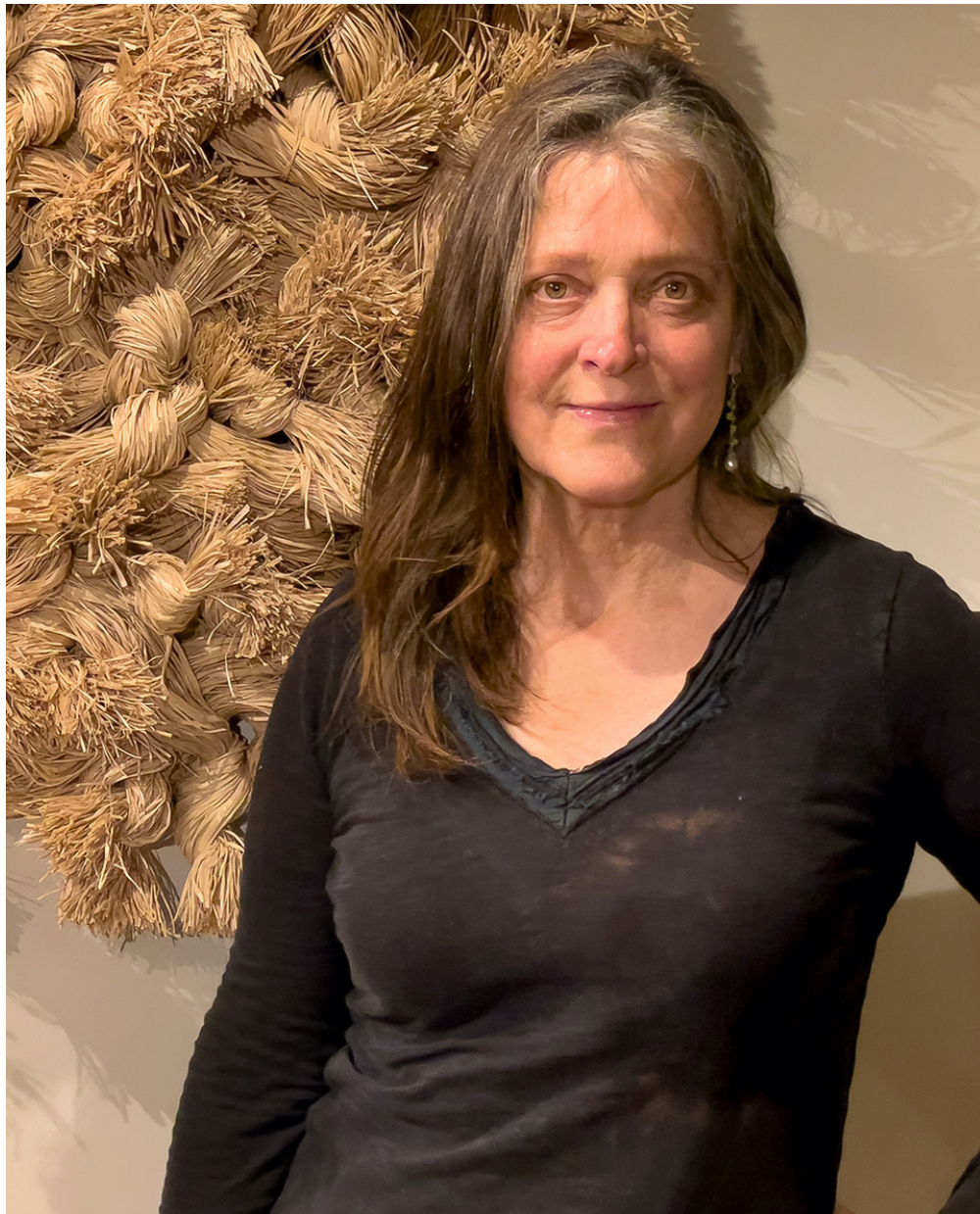
Images: Many Tranquil Moments | Knotted Raffia | Lilac-Hazelnut | Transition VIII | Effervescent Energy