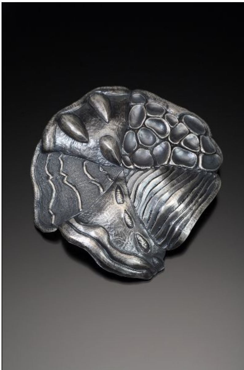
Image: Larry Metcalf, Just A Touch Words Unspoken, Mixed Media, 2019