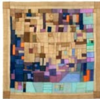
Patti King Refuge 30"x31" Ramie, hemp, silk organza, wysteria, sewing thread.