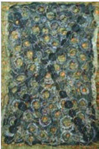
Zia Gipson Criss Cross 24"H x 20.5"W Description: Materials are long fiber paper and cord mounted on silk background. Process is joomchi (Korean 'felted' paper)

La Conner Quilt & Textile Museum 703 South Second Street La Conner, WA (360) 466-4288 http://www.laconnerquilts.org/beyond-the-surface.html