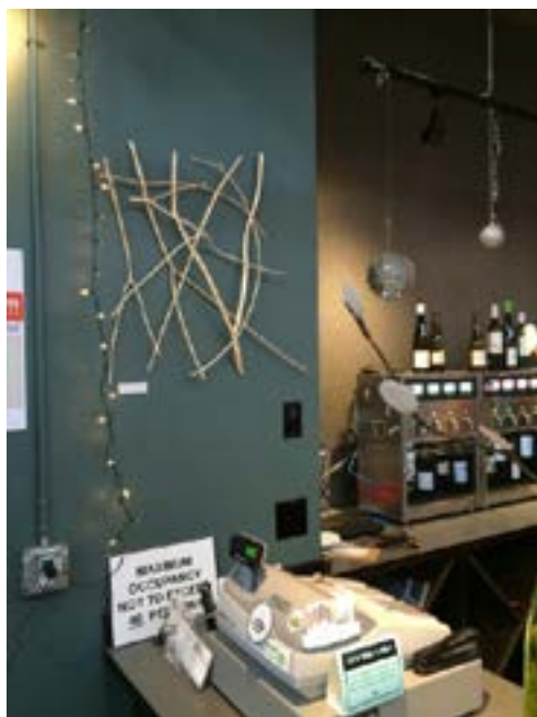
Moving Out , peeled lilac