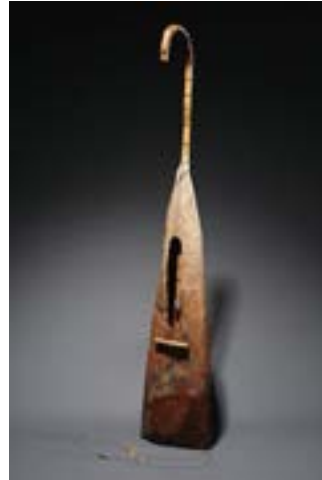
Danielle Bodine Autumn Stroll 38"Hx7"Wx3"D Cast mulberry papers, collaged, waxed linen, bamboo cane, bamboo, beads

Natalie Olsen Bug Dream 14" X 11" Materials: Dried flowers & petals, silk fusion on wool background Technique: hand-felted silk, dyed wool