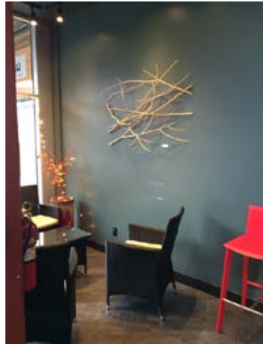
Holding Empty Space , peeled hazelnut, willow, and maple