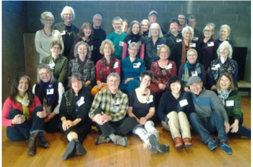
NWDC 2016 Annual Meeting Group Photo