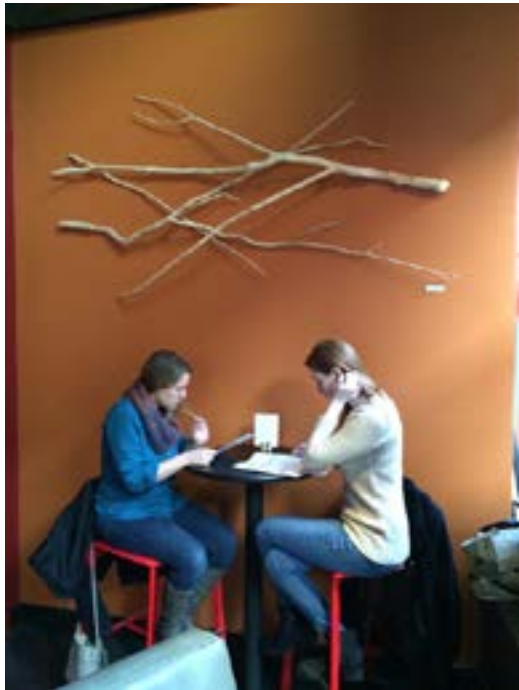
Coming Together , peeled birch