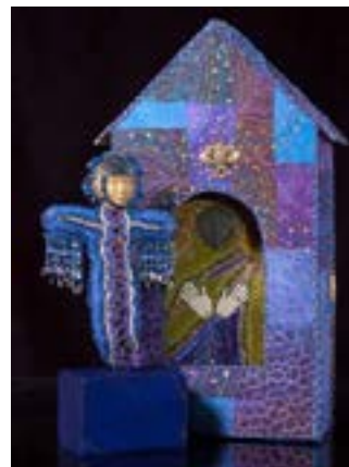
Larkin Jean Van Horn The Mentor 12"h x 7"w x 4"d plus doll Mixed-media textile