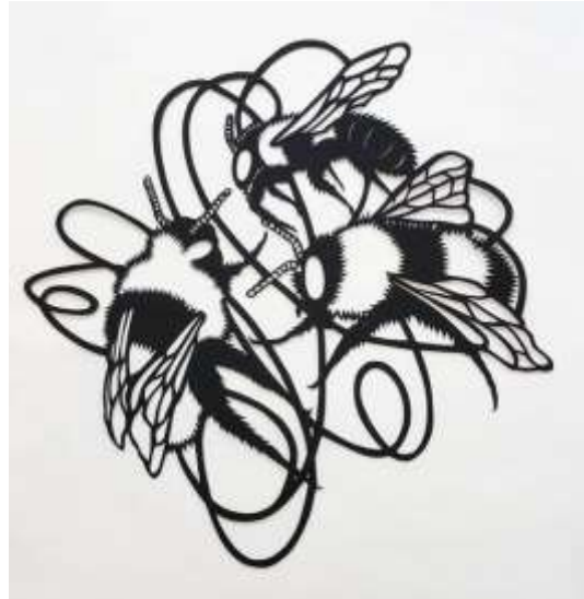
Ann Chadwick Reid Bees Unease , 2019 hand cut paper 13" x 13"