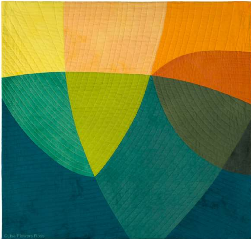
Lisa Flowers Ross Leaf Stack #20 , 2016 hand dyed fabrics, thread 33-1/2" x 35-1/4"

The artwork, Leaf Stack #20 , by Lisa Flowers Ross has been selected to be exhibited in the Abstractly Speaking exhibition at Woman Made Gallery in Chicago. The exhibition highlights "art which is non-representational and unconcerned with literal depiction, instead relying on the visual language of form, color, line, texture, mark-making and process, as a means to an end."