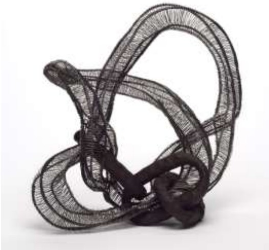
Leah Gerrard Knot , 2018 steel wire, rusty chain links 14" x 8" x 3"