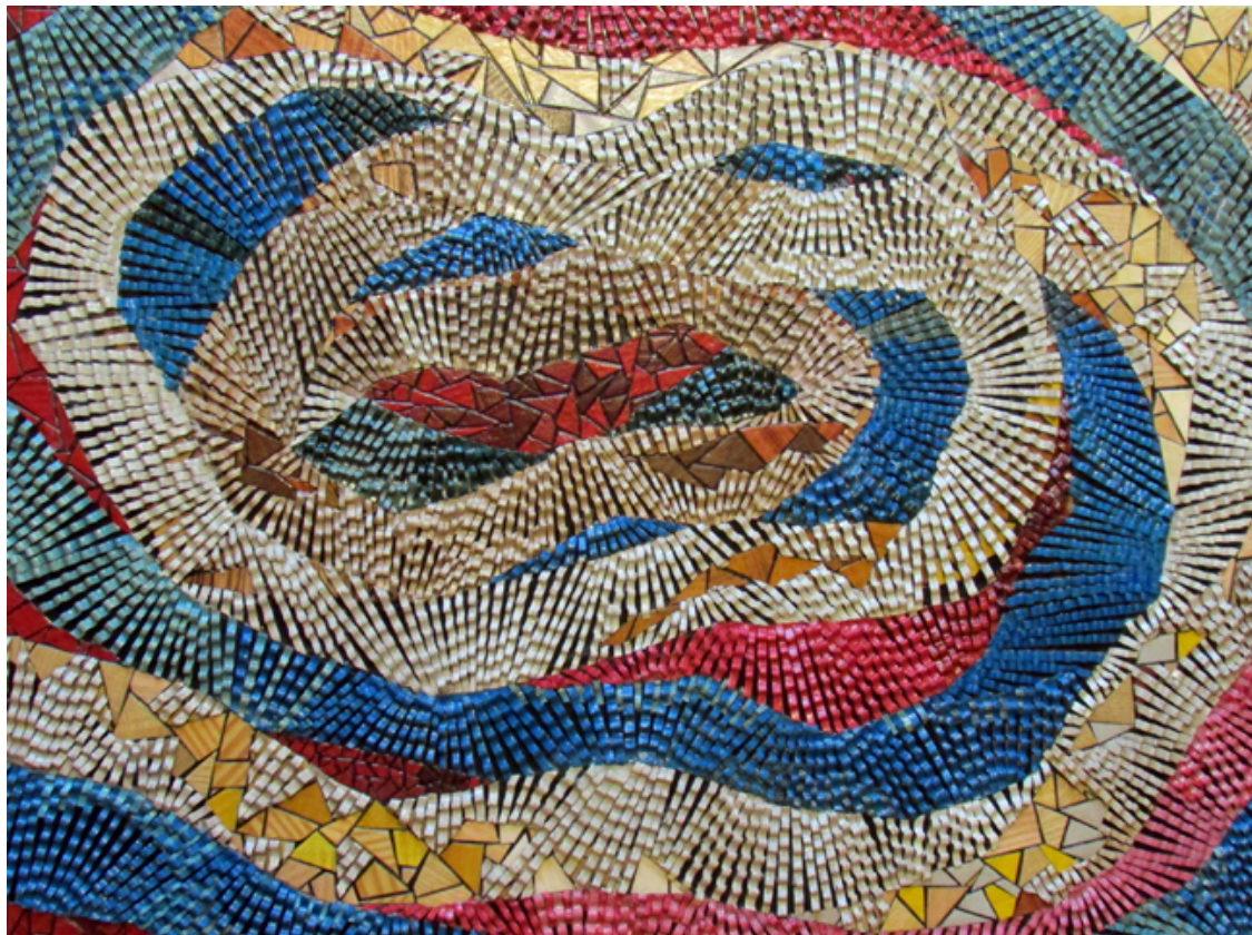
Naoko Morisawa New Wave - Imagine III