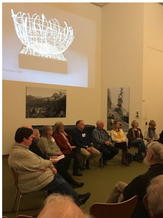
Some members of the panel.

For more information about the Whatcom Museum visit whatcommuseum.org .