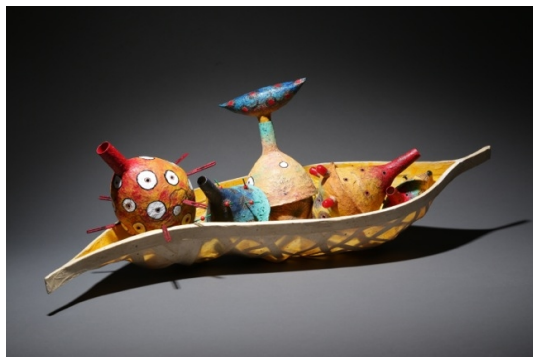
Danielle Bodine Alien Fruit Basket mixed media

Bellevue College Gallery (2nd floor of Building D, Room D271) 3000 Landerholm Circle SE Bellevue, WA (Parking: https://www.bellevuecollege.edu/ )