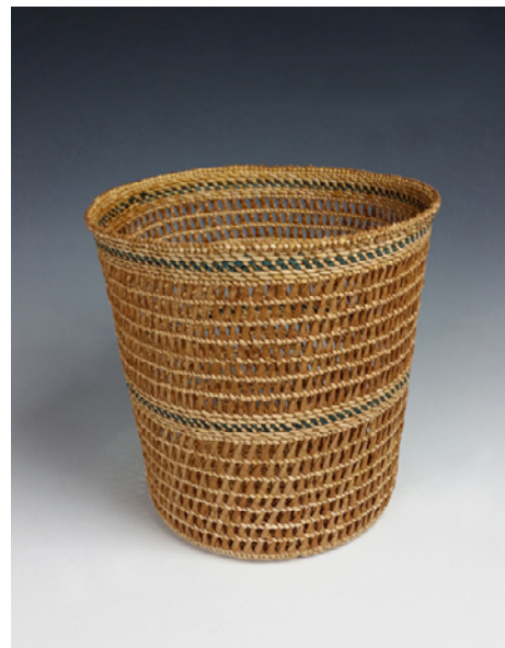
Lisa Telford Spoon Basket yellow and red cedar bark 8” x 8” x 8”