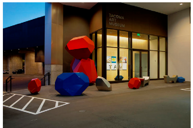
Kinetic Repose, 2014, Bronze