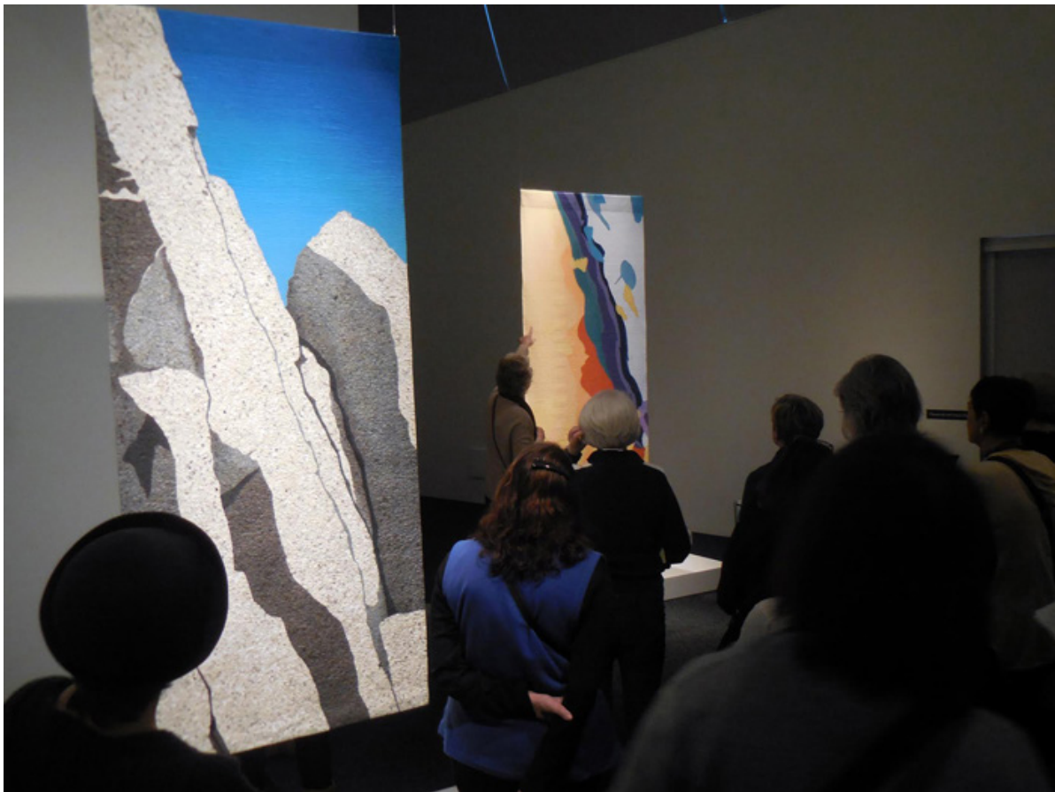
The docents' tour at the Bellevue Arts Museum of The Contact: Quilts of the Sierra Nevada .

Workshop Dates: April 28-30, 2017 Times: 10 a.m. - 4p.m. Class is full. Email admissions@bellevuearts.org to be put on the wait list