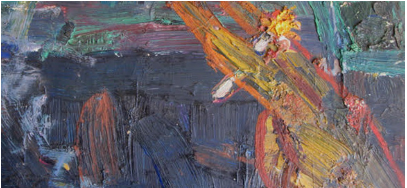
Peng Gang Untitled circa 1970