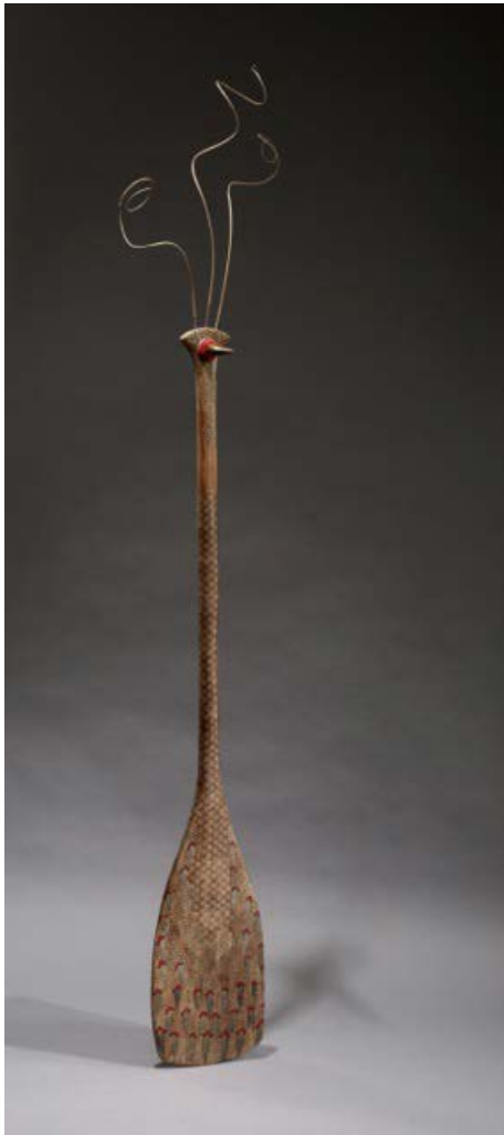
Danielle Bodine Paddle Bird 72” H x 9” W x 5.5” D Wood Paddle, collaged, painted, coiled, cane tip, ting grass

MUSEO 215 First Street/P. O. Box 548 Langley, WA 98260 360.221.7737 http://www.museo