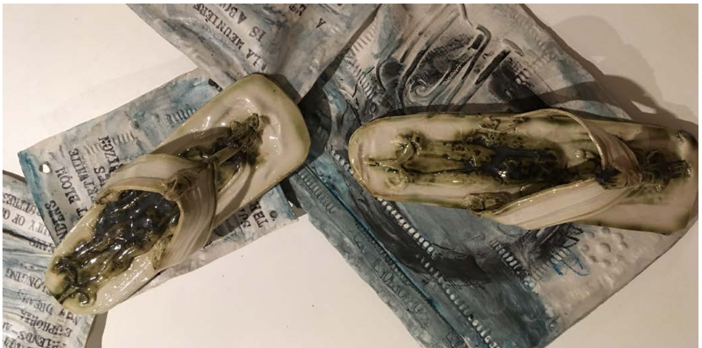
Inge Roberts Catching waves/Chasing dreams porcelain