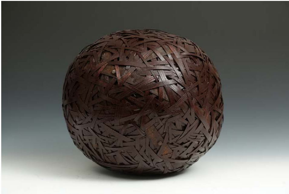
Nancy Loorem Fukushima Beach Ball 2016 Veneer and Steel 20 X 20 X 20"

MUSEO Gallery Beach Party Show, continued