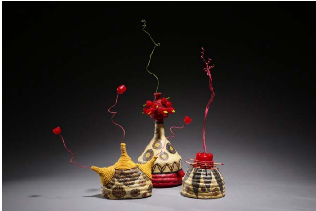
Danielle Bodine Sea Anemones and Urchins 14” H x 12” W x 5” D Coiled figures, collaged prints, mulberry papers, plastic tubes, wires, beads, hairbrush tines.