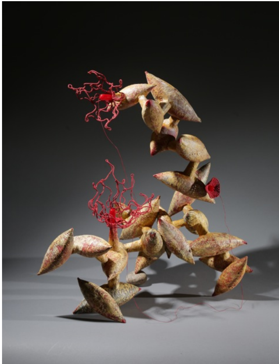
Hybrid Coral Polypus , 2015