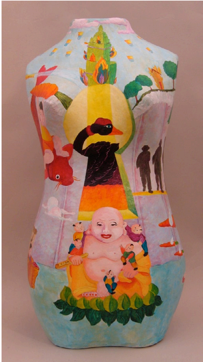
One Child Policy