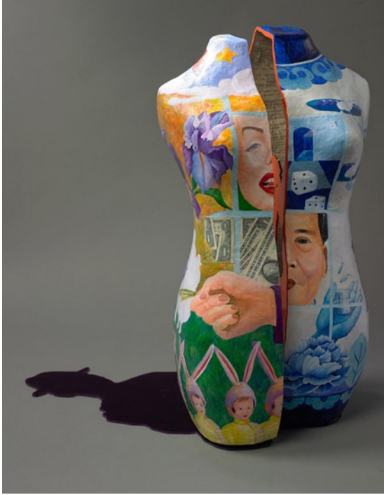
Marilyn & Mao